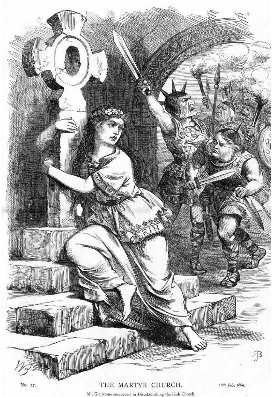
“The Martyr Church” Mr Gladstone succeeded in Disestablishing the Irish Church’ ( Judy, 28 July 1869)