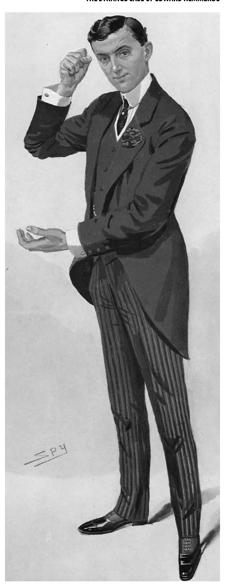
E. G. Hemmerde, depicted by 'Spy' (Leslie Ward) in Vanity Fair, 19 May 1909; the caption is 'The New Recorder'

I am sick of the talk of friction in E[ast] D[enbighshire]. If they