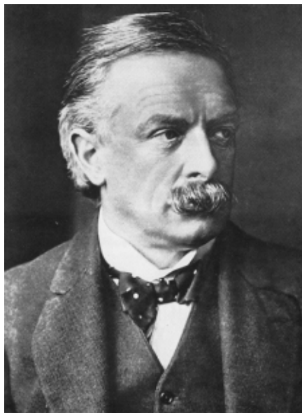
David Lloyd George, Liberal Leader 1926–31 and Prime Minister 1916–22.

but refused to use it as he had little confidence in the Coalition. In any event he was unopposed. For a very brief moment he inclined towards the Asquithians; then he despaired of them too and joined Labour. Noel Buxton, who had sat as a Liberal MP for North Norfolk down to 1918, was defeated by a ‘couponed’ Conservative. What decided him to defect was the iniquitous peace treaties which began to emerge in 1919. Early in 1920, when Asquith was fighting his successful campaign in Paisley for return to the House of Commons, nine men who had formerly sat as Liberal MPs sent a letter of support to his Labour opponent. 9