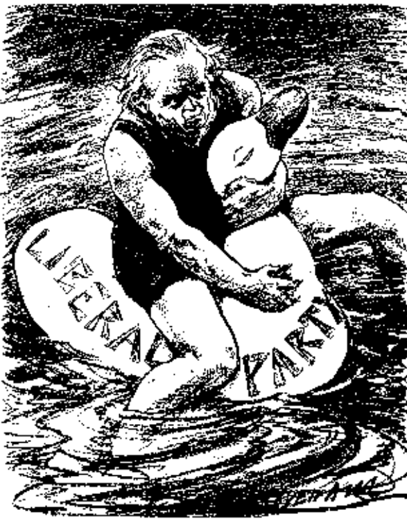
A FAST MASTER OF BALANCE.

WE SHOULD NOT ASK TO THINK THAT I ON FORTNIGHT THAT I SHOULD HOLD THE BALANCE BETWEEN THE PROGRESSIVE PARTIES.